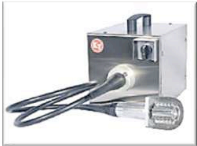
304 STAINLESS STEEL (INLCUDES FRAME)