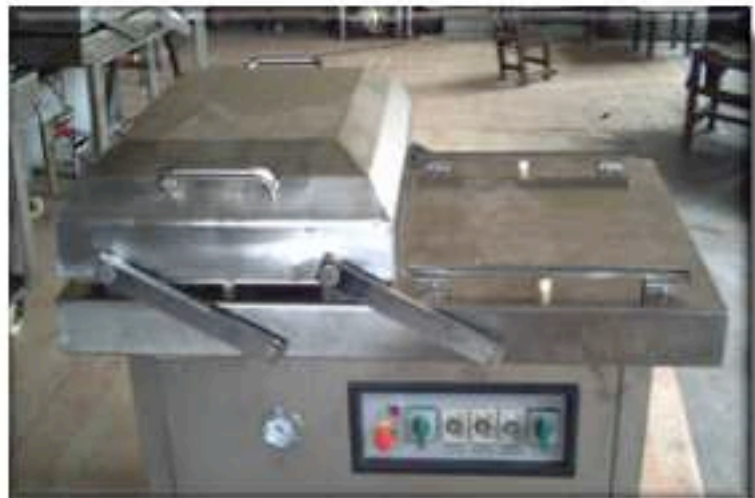
304 STAINLESS STEEL (INCLUDES FRAME)