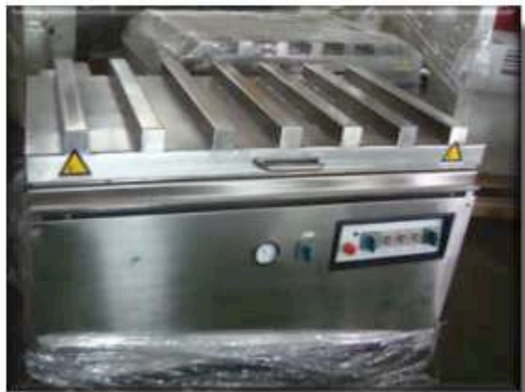
304 STAINLESS STEEL (INCLUDES FRAME)