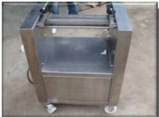
304 STAINLESS STEEL (INLCUDES FRAME)