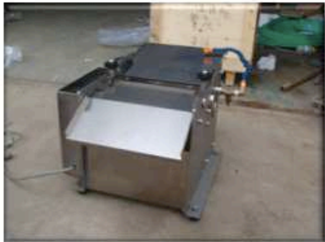
304 STAINLESS STEEL (INLCUDES FRAME)